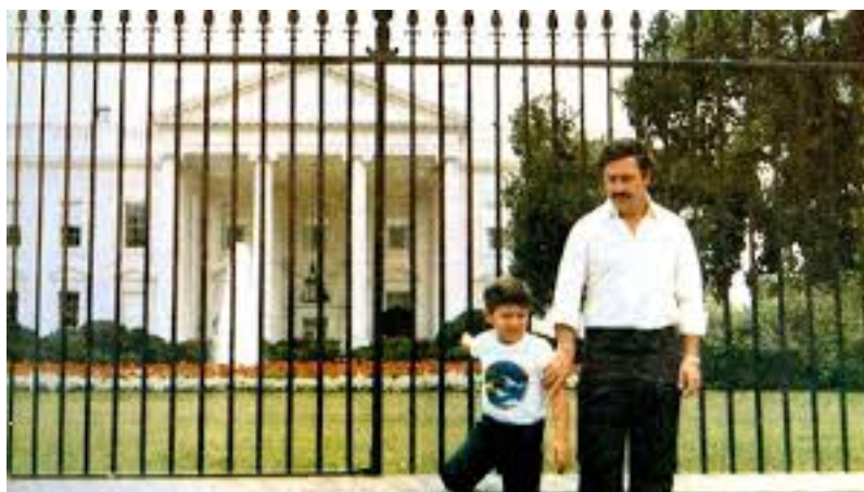
Figure 4: A photo of Escobar and his son in front of the White House in 1981

Once the most dangerous country in the world, in 1984 the national homicide number in Colombia was 9,721, more than double the 1970 level, despite the fact its population of 30 million only increased by half over the same time period. 46 To put this in context, according to a New York Times article, Vigilantes Fight Crime in Colombian City : “over the last decade, the number of murders in Medellin exploded almost tenfold: from 730 in 1980 to 7,081 in 1991. By contrast, New York City, with almost four times Medellin’s population of 2 million, had about 2,200 murders in 1991.” 47 Moreover, in 1980, political killings only accounted for 1 percent of total killings; three years later they increased to 8 percent. 48 Additionally, approximately twice as many people died in a violent manner in 1984 compared to 1980. Of these killings, 75 percent were due to firearms, up from 65 percent. In 1998, this figure would rise to 80 percent. 49 Escobar contributed greatly to