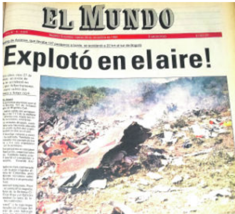
Figure 6: Avianca Bombing: November 27, 1989 Death Toll: 107, including two American citizens.

anger in some Colombians. “Judges and magistrates whose low salaries were barely enough to live on, but not enough to pay for the education of their children, faced an insoluble dilemma: either they sold themselves to the drug traffickers, or they were killed.” 106 Escobar’s ruthlessness and unwillingness to succumb to the Colombian government’s wishes is expressed when he says: “thirty million Colombians can come to me on their knees, and I still won’t let them go” 107 Here, Escobar is discussing the request to release prominent hostages he would kidnap in an attempt to force the government to succumb to his demands. Again, Escobar depicts the inevitable consequences of fighting for his drug business—hurting the innocent—and, for the sake of himself and the social groups he represents, is willing to perform whatever actions necessary to protect his agenda.