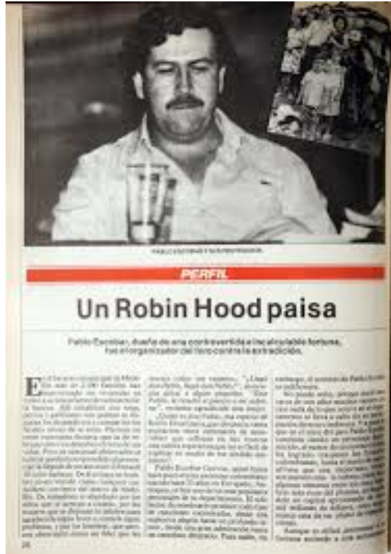
Figure 2: Semana, a well-recognized Colombian magazine outlet publishes the first article depicting Escobar as a Medellín Robin Hood figure.

Regardless of which biographical, historical, or fictional account one reads of Robin Hood, its central theme centers on fighting for justice and equality, often by means of breaking the law in a system deemed severely corrupted.