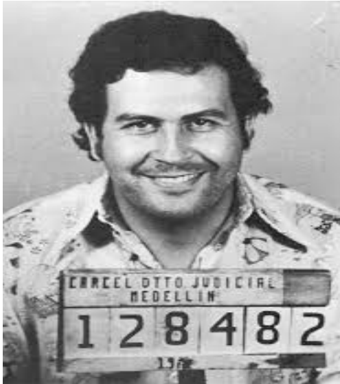
Figure 5: Mugshot of Escobar's first arrest: 05/1976

In addition to coining his famous ultimatum, Escobar constructed a 63 million USD estate, Hacienda Los Napoles, which served as his home base. Here, he would not only reside, but also run his business operations and contract killings. The estate had helicopter access and a network of roads that allowed easy entry and exit, not only for Escobar, but also the politicians, businessmen, and celebrities he invited, in addition to those who attended his massive parties. Included the estate was his own zoo, home to exotic animals he would fly in from across the world.