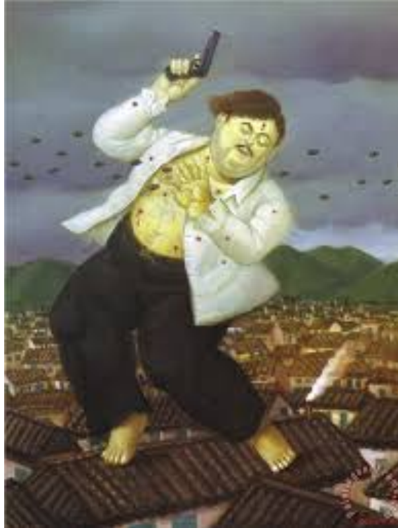
Figure 8: “Pablo Escobar Muerto,” by Fernando Botero. This painting is an illustration of Escobar’s death. His influence on Colombia is illustrated in his massive depiction. A hail of bullets are headed towards him, and he goes down fighting with a single gun.