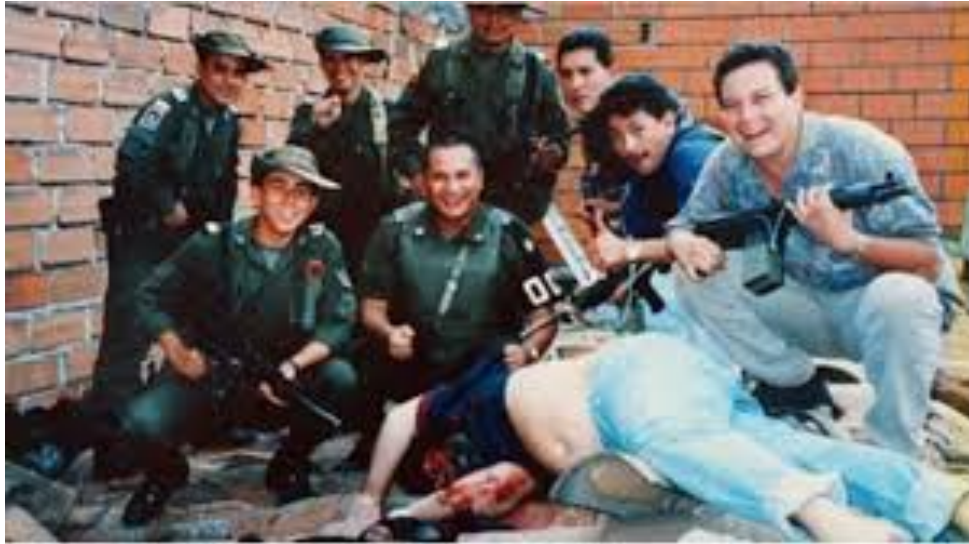
Figure 7: Escobar's corpse lies before jubilant Colombian troops.

increases his mythical aura. There are those who truly believe Escobar shot himself to prevent any possible satisfaction for Colombian forces.