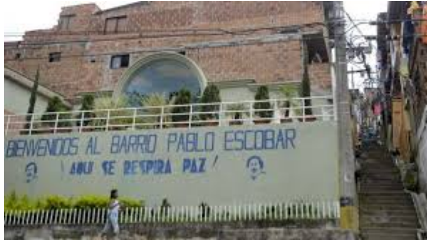
Figure 1: “Welcome to the neighborhood Pablo Escobar, here you can breathe peace.”

Brilliantly, Escobar focused on enhancing his public image by exposing the failures of the Colombian government. By concentrating on improving the lives of people and areas of Colombia that the government failed to attend to, in particular its poorest citizens, Escobar’s criminal activity was not of much concern to his loyal followers. As long as Escobar would continue to use the money, power, and influence he accumulated from his drug business to help others, he would be able to construct an image of a hero. Prior to Escobar’s work in slums, much of the Colombian elite had completely neglected the poor. Escobar was able to constantly refer to his humble upbringing, and construct a story that many admired greatly. When travelling to Medellín, Nicholas Coghlan, in his book Saddest Country , inquired what a man previously employed by Escobar thought about the drug lord, to which his interviewee responded: “he was not a bad man, you know. He did many things for us. He built our stadium. He built houses. He put in