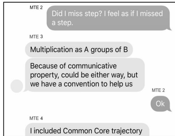
Figure 2. Text messages shared between MTEs at the beginning of the lesson

The exchanges were quick and to the point, as MTE-2 was in the middle of teaching her lesson and only had a moment to converse. In Figure 2, MTE-3, a content MTE, addressed the need to focus on the meaning of multiplication as A groups of B , while MTE-4, a methods MTE, mentioned the missed opportunity to address the content standards. This collaboration between content and methods MTEs allowed for us to ensure that both areas (mathematics content and pedagogy) were addressed in the lesson. After MTE-2 viewed the messages, she began the next part of the lesson by drawing students' attention to the concerns highlighted by the other MTEs. Technology thus facilitated our real-time observation of MTE-2's classroom, provided a learning opportunity across geographical distances and served as a rewarding and powerful means of professional reflection for everyone, as highlighted through the excerpt below: