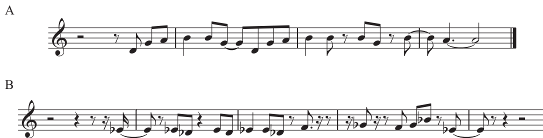
FIGURE 2. Items eliciting the highest average “old” ratings (A: Under the Boardwalk , The Drifters, 1964) and the lowest average “old” rating (B: I Wanna Dance with Somebody , Whitney Houston, 1986).

When comparing the two models we note that there is only limited overlap in the precise features selected as explanatory variables. However, “old” judgments seem to be driven by rather similar features in both models: Features that indicate the use of infrequent motives are associated with high ratings on the recognition scale. In fact, the features mtcf.norm.log.dist (from old-item model) and mtcf.TFDF.spearman (from new-item model) are conceptually related and measure the association between motivic frequencies in a corpus and a given melody item, albeit using different techniques (i.e., distance computation and rank-based correlation). Thus, the relationship between infrequent motives and “old” judgments holds true for old items and new items alike. And in fact, when we pooled hits and false alarms in our data across the 80 items we obtained a significant positive correlation of participants’ explicit ratings over old and new items of r = .34 , t(78) = 3.16 , p = .002 , 95% CI [.137, .518] confirming that certain items generate “old” judgments regardless of whether they were heard before or not.