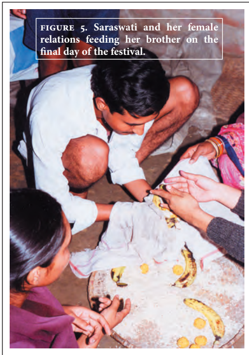
FIGURE 5. Saraswati and her female relations feeding her brother on the final day of the festival.