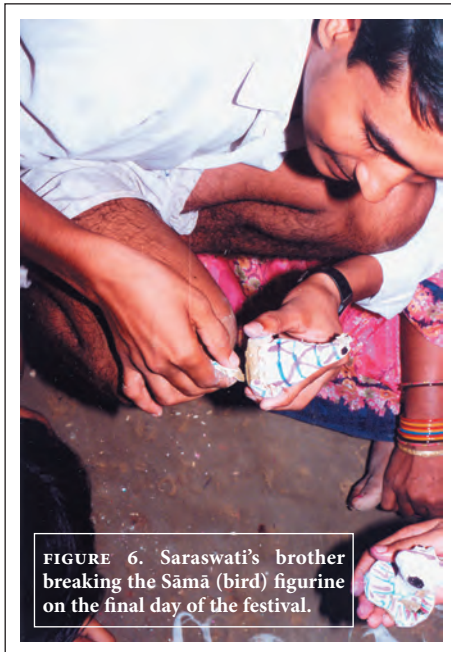
FIGURE 6. Saraswati's brother breaking the Sāmā (bird) figurine on the final day of the festival.