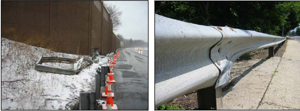
Figure 1. Does the damage to these w-beam barriers hinder their performance?