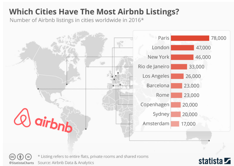
Figure 1.1 – Most popular Airbnb listings – StatistaCharts

Moscow, and Sao Paulo. These additional offices added to the existing four in San Francisco, London, Hamburg, and Berlin. With only 16 percent of their listings coming from the United States as of June 2016, Airbnb has proven to be a truly internationally focused business. New York and San Francisco serve as the only two US markets in the corporation's list of top ten, with Paris as number one.