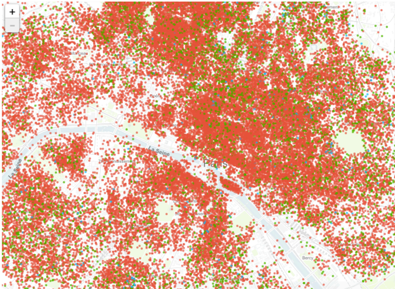
Figure 1.2 – Airbnb listings in Paris provided by Inside Airbnb