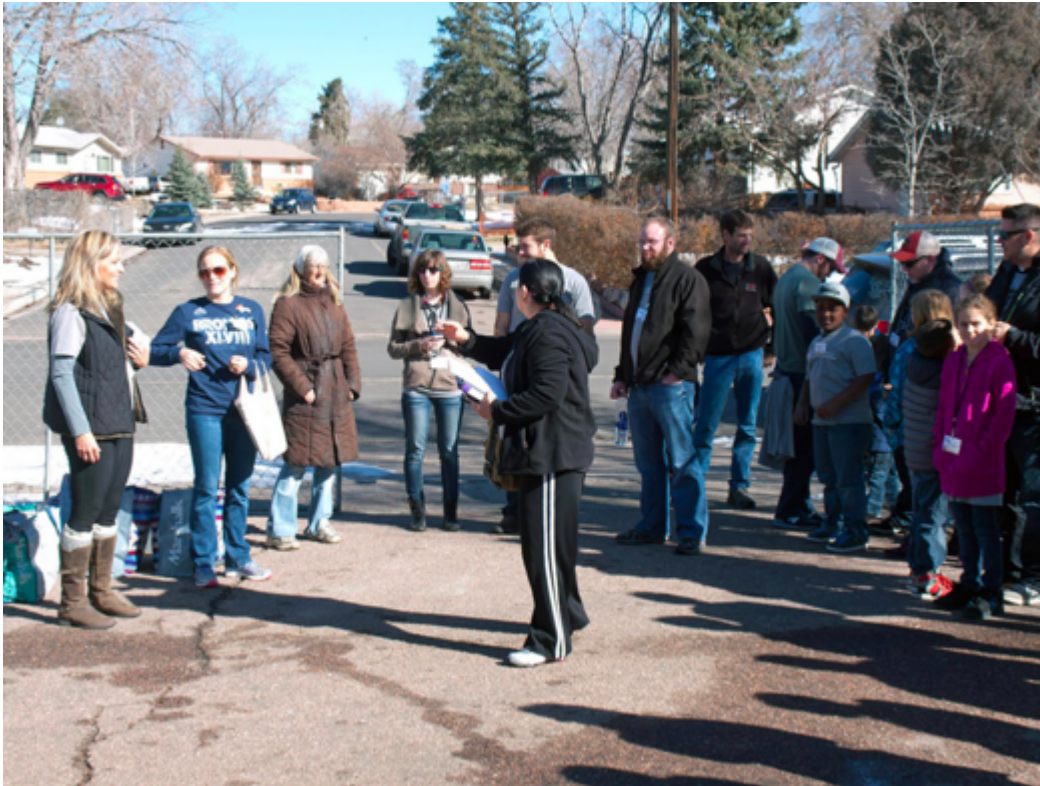
Figure 1: This image depicts a Block Captain holding a meeting with her street’s local community members to discuss the block’s rules and to make sure everyone is keeping up with the standards she has set.