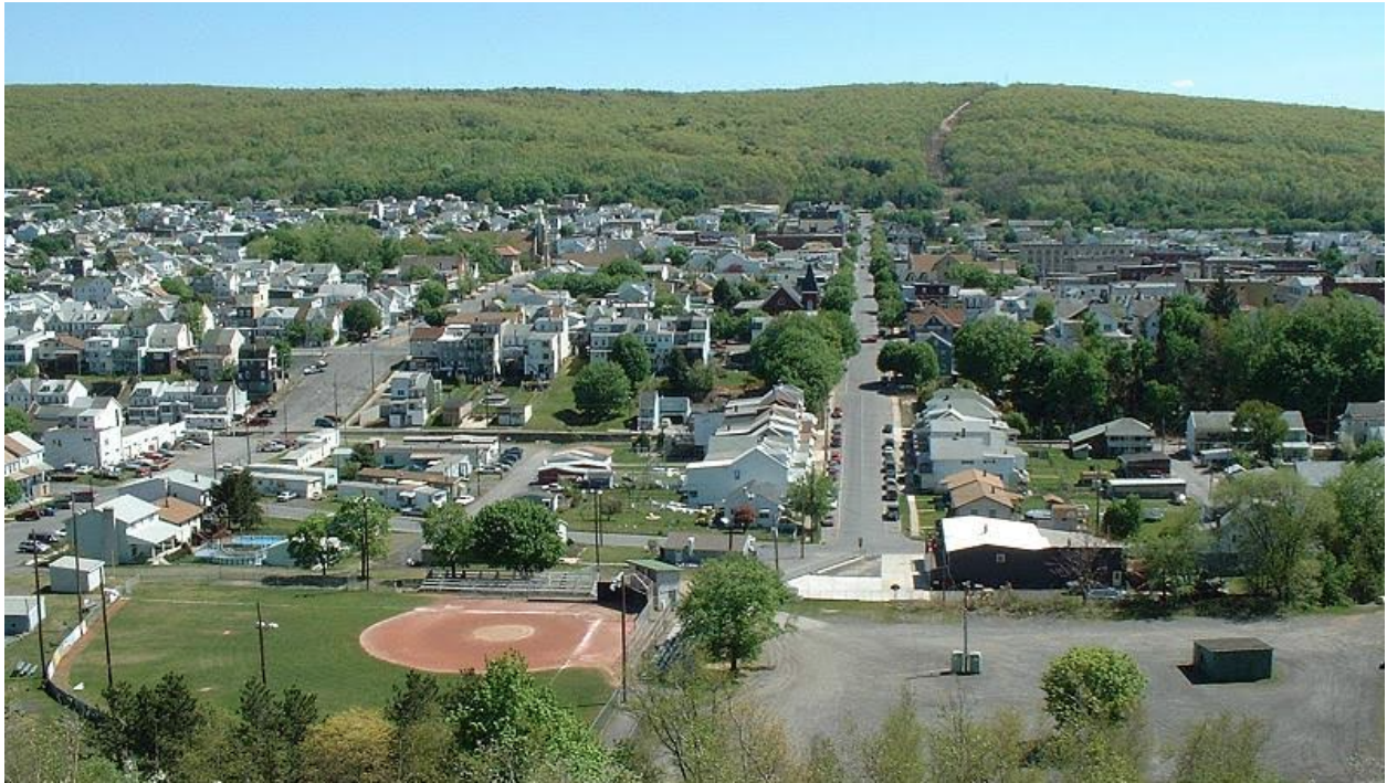
Figure 2. This image shows an area (the open baseball field) in Mt. Carmel that could potentially be used for a community recreation program involving sports and activities.