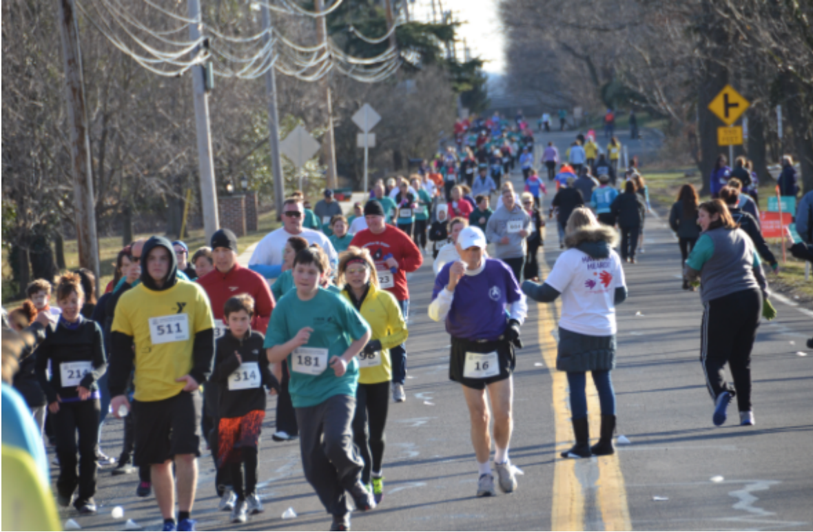
Figure 4. The image above shows what a Community Walk would look like. It shows how community members would walk/run together for a good cause while raising awareness and raising money.