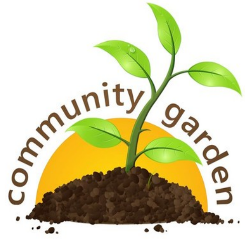
Figure 3. This image shows how community members can purchase lots in a local their local community gardens to grow and maintain a healthy food supply as well as making the town more green.