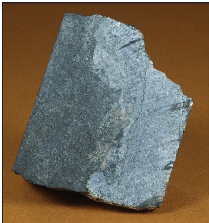
Figure 1. The Desert View Mine hardystonite specimen, showing the gray calcite layer (right) and the black oxide layer (left). The hardystonite bleb is along the contact zone, near the top-center of the specimen as photographed. The visible surface is sawn; specimen measures 2\frac{3}{4}'' \times 2\frac{1}{4}'' \times 1\frac{1}{2}'' ( 7 \times 5.5 \times 4 cm).