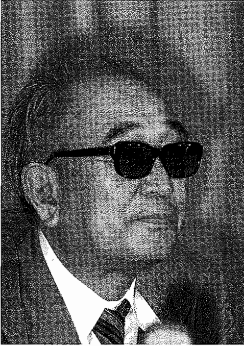
Japanese director Akira Kurosawa at the Cannes International Film Festival, 1980.

casting off her husband? Kurosawa, here as in his later samurai films, turns a critical though not wholly dismissive eye toward values such as loyalty and honor, which seem so often to be swallowed up by our very worst tendencies: greed, pride, malice. It is not so much that each of the Rashômon characters is engaged in outright falsehood but that they may be deceiving themselves most of all, caught up in their respective webs of self-justifying illusions. This, if anything, is their sin—the inability or unwillingness to see through the illusions that ground their very identities as consistent and unchangeable “selves.” Interpreted this way, Rashômon takes on a distinctively Buddhist flavor. From a Buddhist perspective, the moral failure of the characters can be attributed in large part to their