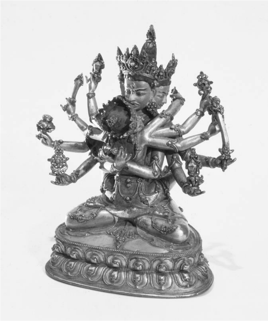
Figure 4.6 Kalacakra in yabyum embrace with Visvamata, 17th century. Image used with permission.

and recent studies of the use of religious motifs in US advertising indicate that, if anything, Western religions are more likely to be mocked or derided than their Eastern counterparts (Moore 2005).