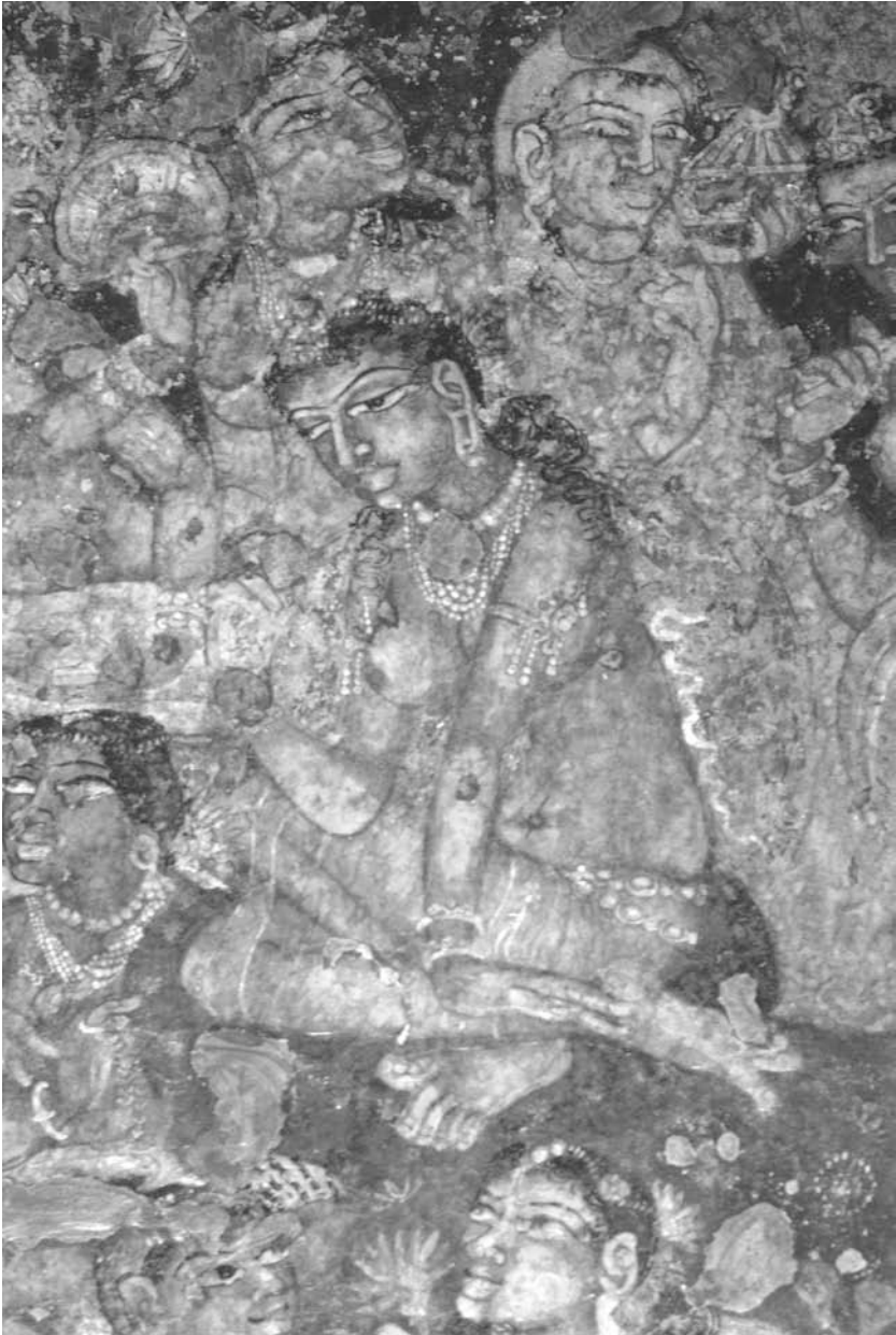
Figure 4.3 Detail of wall painting from the Ajanta caves, Ajanta, India, ca. 6th century CE. Image used with permission.