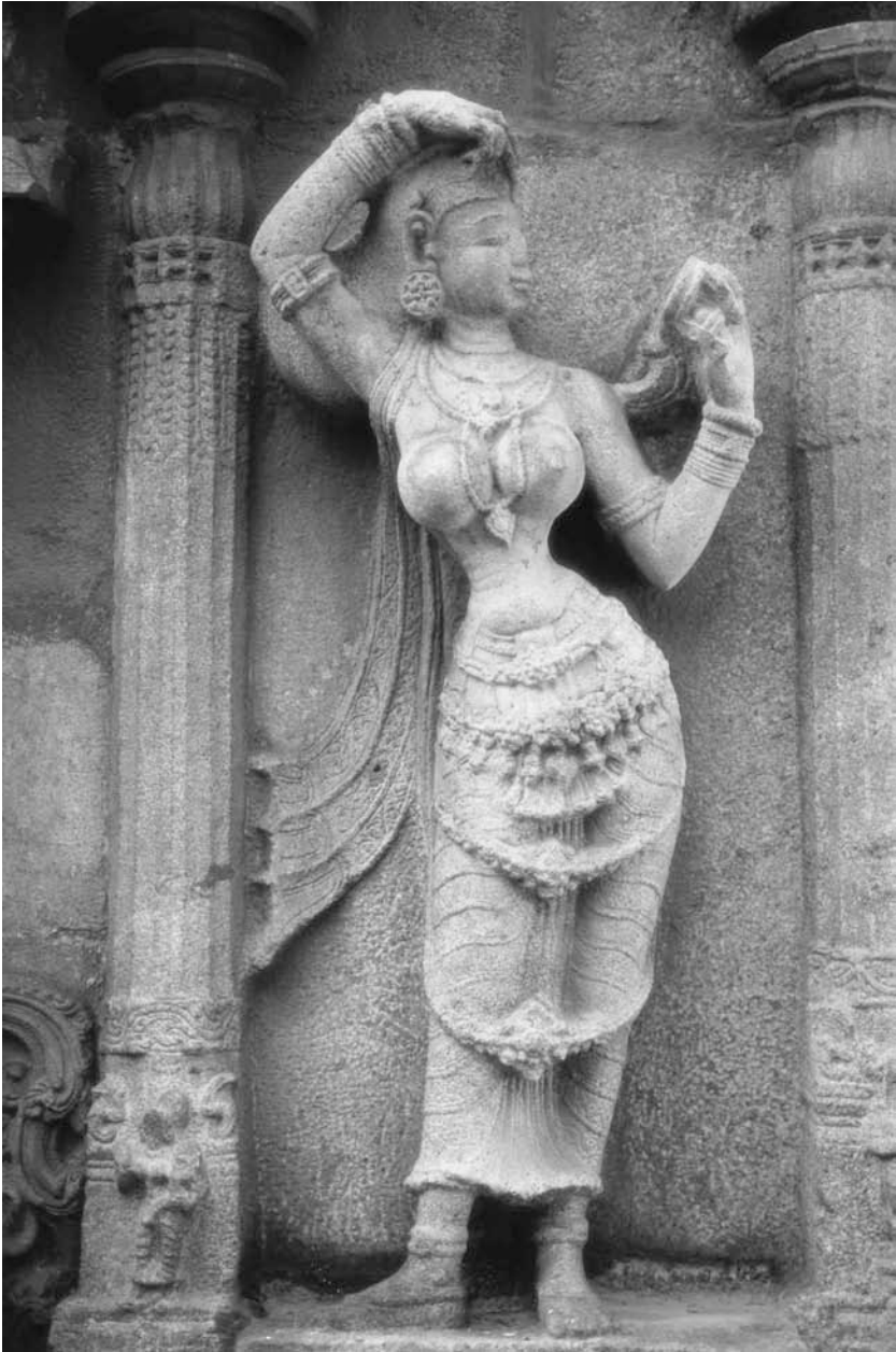
Figure 4.5 Sculpture of yakshi at Srirangam Temple. Image used with permission.