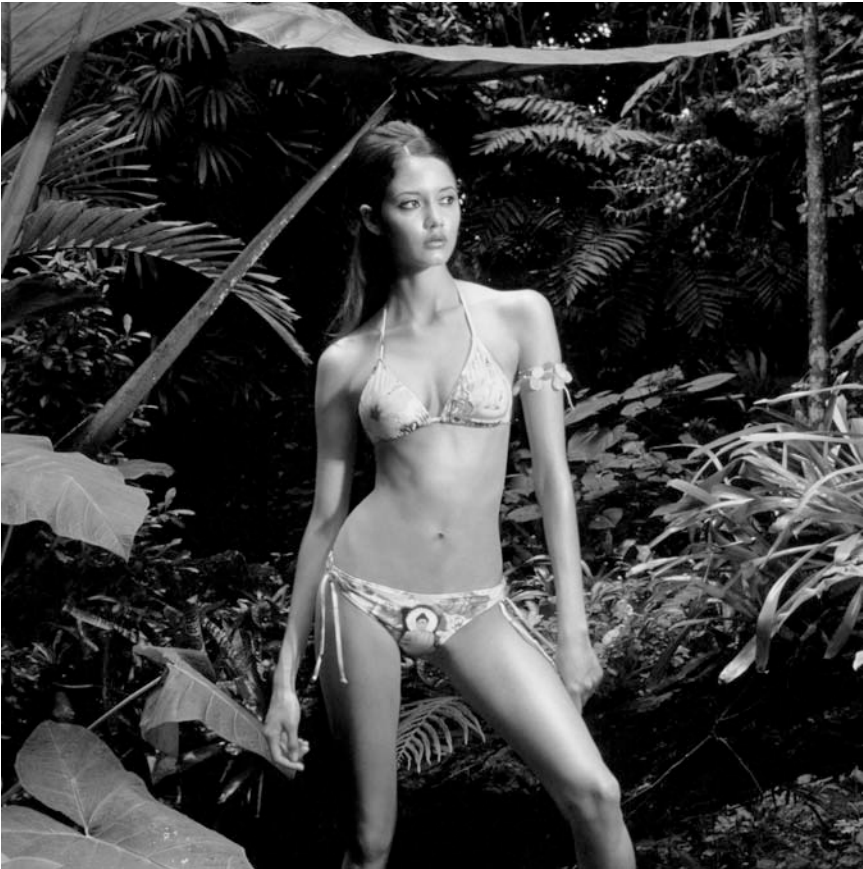
Figure 4.1 OndadeMar’s “Baby Buddha Bikini.”

whom chimed in with their fellow Buddhists about the “tactlessness” and “orientalism” of the suits and the offending company. Employing the internet as a source for protest, Buddhists worldwide launched a campaign against Victoria’s Secret. 3 Against the growing barrage of criticism, the company discontinued the line, though they did not offer a recall of the sold products, and were initially hesitant to offer an apology to those who were upset by the Buddha bikinis. Indeed, in a public statement the company denied knowledge that the image on the suit was indeed “the Buddha,” and proceeded to pass the blame to the manufacturer, a Columbian company called OndadeMar. OndadeMar, in turn, discontinued its own version of the Buddha bikini, which it called the “Baby Buddha Bikini” (Figure 4.1), and promptly removed all offending images from its website ( www.ondademar.com ).