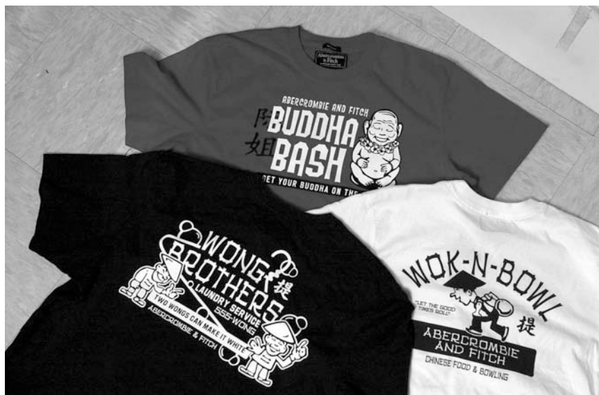
Figure 4.2 Detail of Abercrombie & Fitch's "Buddha Bash" t-shirt. Image used with permission.

The Buddha bikini was not, in fact, the first case in which commercialized images of the Buddha were the cause of controversy in the USA. In early 2002, trendy retailer Abercrombie & Fitch got into hot water for its new line of Asian-themed T-shirts, one of which was festooned with a stereotypical image of a pudgy Buddha wearing what (inexplicably) appears to be a Hawaiian lei , along with the words "Buddha Bash: Get Your Buddha on the Floor" (Figure 4.2). 4