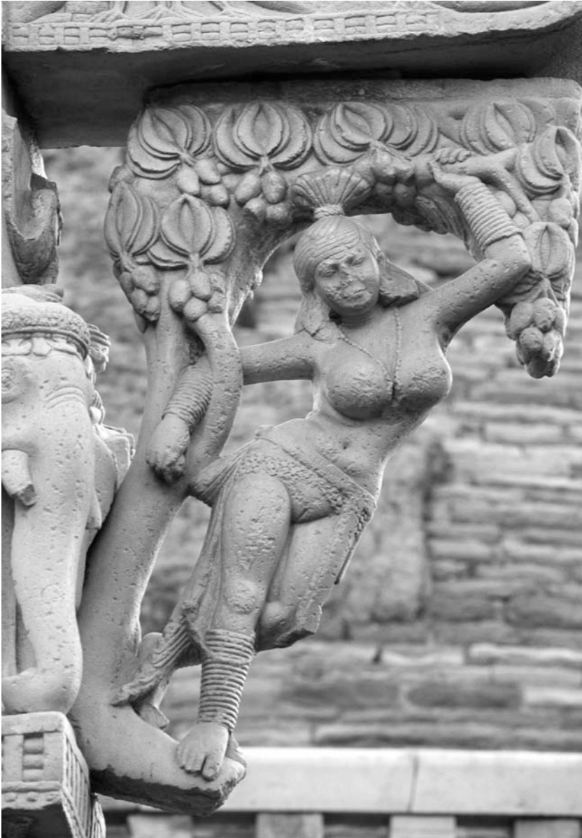
Figure 4.4 Detail of yakshi on East Torana of Great Stupa, Sanchi, India, ca. 1st century BCE–1st century CE. Image used with permission.